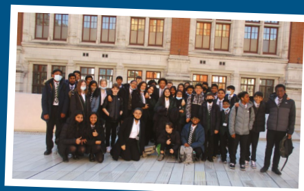
GCSE Art at the V&A Museum