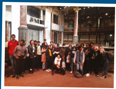
Globe Theatre Trip