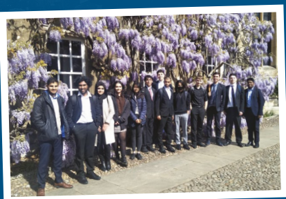
Year 12 Cambridge Trip 2022