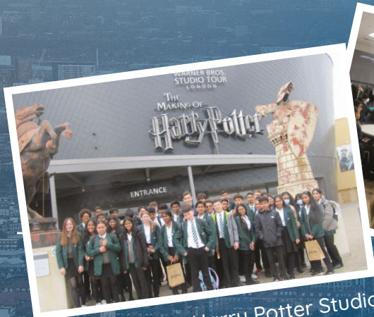
GCSE DT visit to Harry Potter Studios