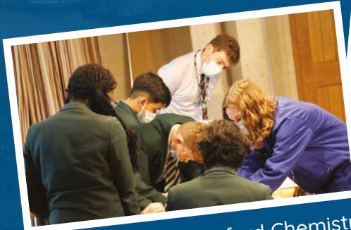
St. John's College Oxford Chemistry Trip