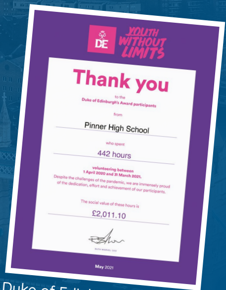
Duke of Edinburgh Certificate