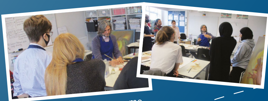
Artist in Residence Programme