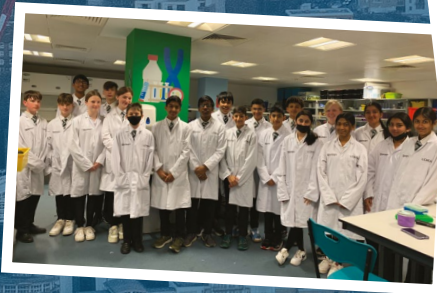
L'Oreal Laboratory Forensics Trip