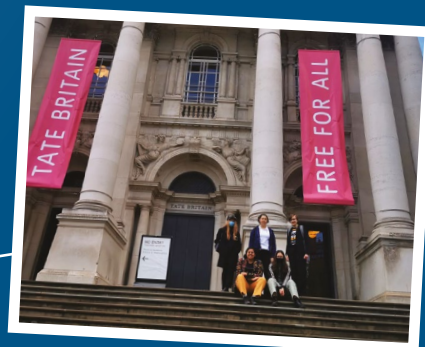
Tate Britain A Level Art