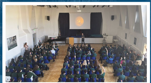
'Life on Mars' Science Week Lecture