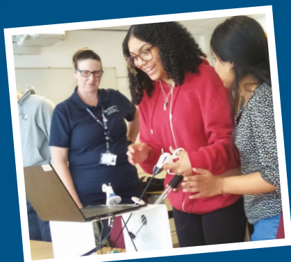
Year 12 Aspiring Medics trip to Birmingham City University