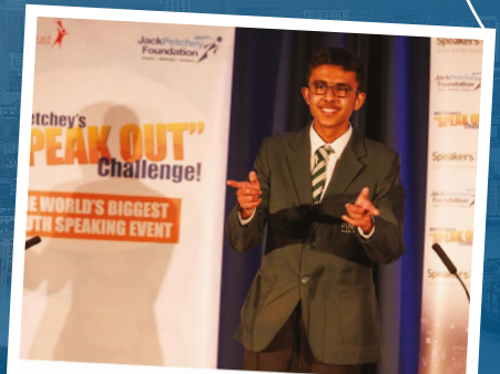
Harrow Regional Final 2021-22