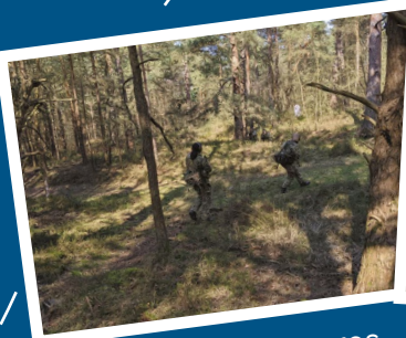
CCF Camp Adventures