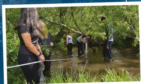
GCSE Geography field trip