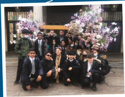
GCSE Music & Drama Trip to Covent Garden