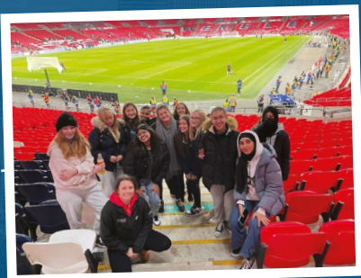
Football Team Wembley Visit